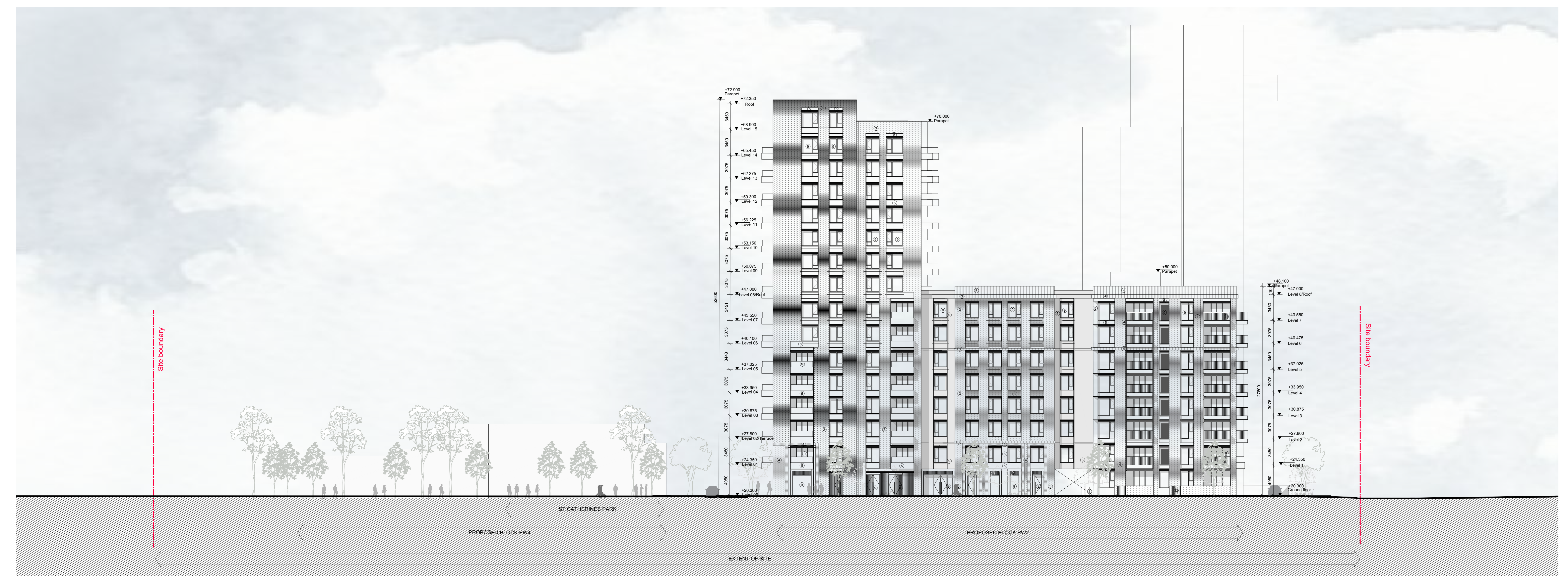
02 Elevation 04 - North Elevation PW2-PW4 SCALE 1:200