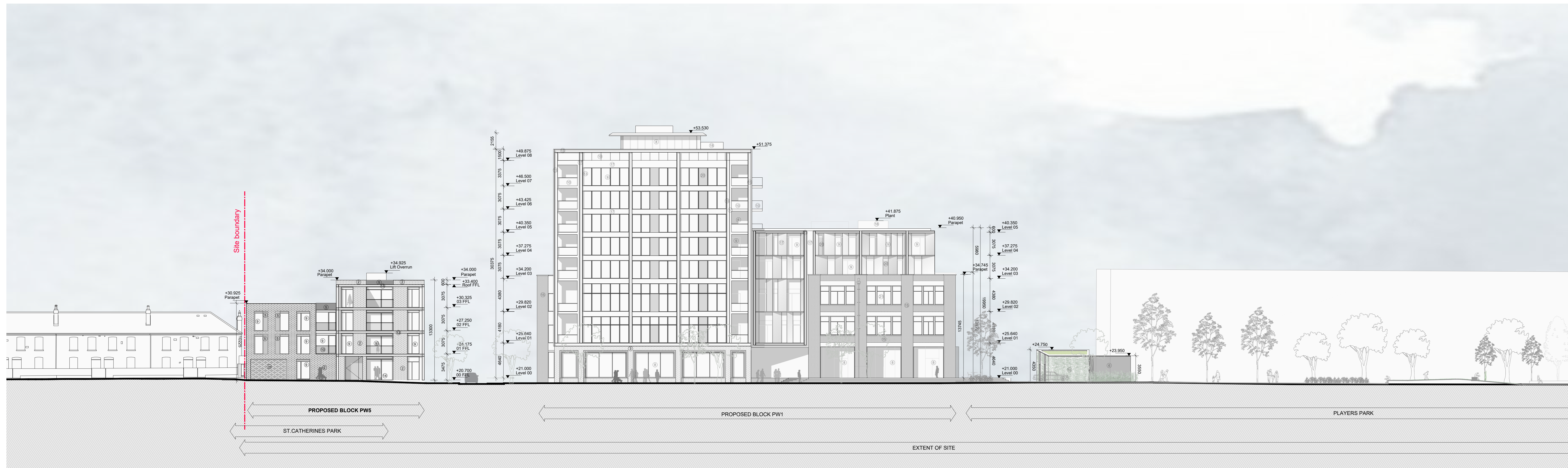
01 Elevation 02 - North Elevation PWS-PW1 SCALE 1:200

NOTE ALL DIMENSIONS TO BE CHECKED ON SITE NO DIMENSIONS TO BE SCALED FROM THIS DRAWING THIS DRAWING IS TO BE READ IN CONJUNCTION WITH RELEVANT CONSULTANTS DRAWINGS